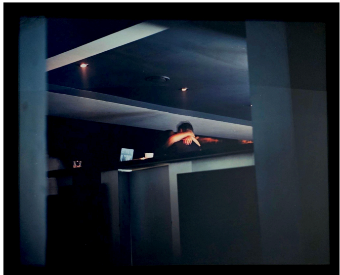
Lucy Levene, Structure (from the series Nightshift ) 2004, c-print, 36 x 43 inches

Fortunately, New York and, indeed, most large cities and their populations are alert and awake. In recognition of that 24/7 vigilance, we are presenting the exhibition, The City That Never Sleeps , a description that perhaps began in a song about New York, New York, but which we extend visually to include nine other cities – Los Angeles, London, New Orleans, Berlin, Chicago, Edinburgh, Venice, Paris, and Rome – that work and play long before and after the day is done.